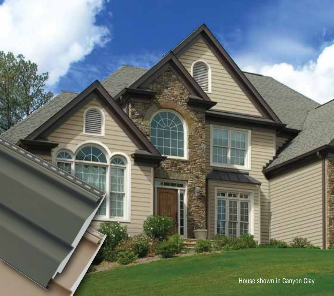
House shown in Canyon Clay.

A fusion of beauty and strength, Sequoia Select EnFusion blends an ultra-premium vinyl panel with energy-engineered insulation – creating a building envelope of superb quality and energy efficiency. It's luxurious, protective and lasting. It's a smart choice for you, a healthy choice for the environment.