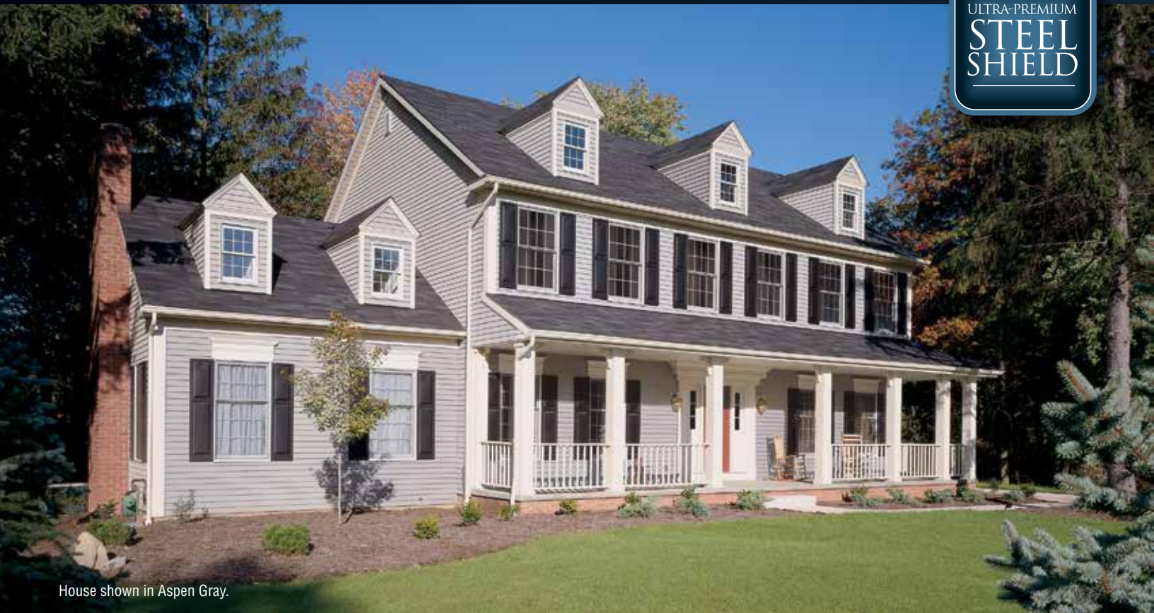
House shown in Aspen Gray.